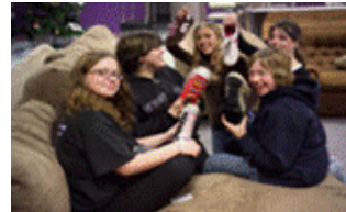
Exciting changes in youth programming are coming this fall!

Across the region, we are serving 6833 members, including 3261 adults, 690 seniors, 948 students and 1934 children and youth. Families comprise 76% of our membership.